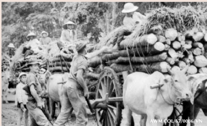
Searching an ox cart