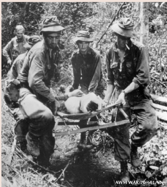
Carrying a wounded man to an evacuation helicopter