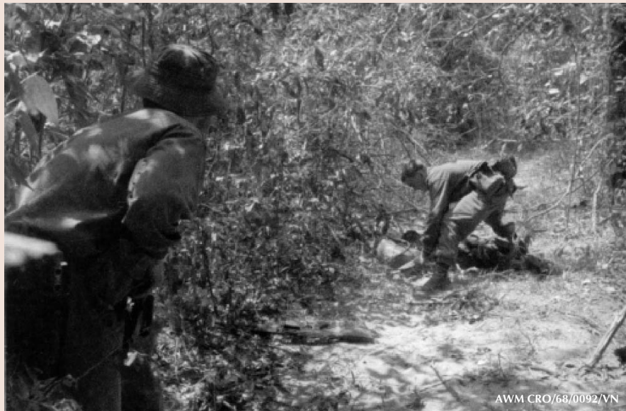
A wounded man on a patrol